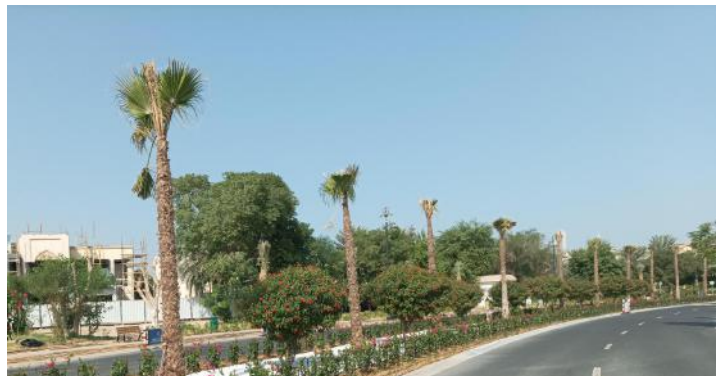
Gate 1 centre median landscaping works have been completed.