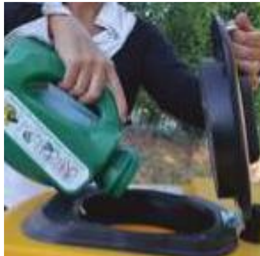
Once full, the used cooking oil containers can be emptied into larger collection tanks that will be available in the community