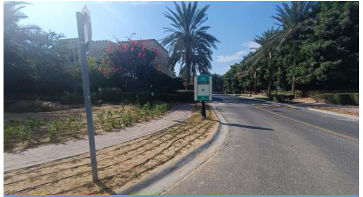
Landscaping enhancements in progress along stretch of main driveway and right-of-way from Clusters 5 to 13.