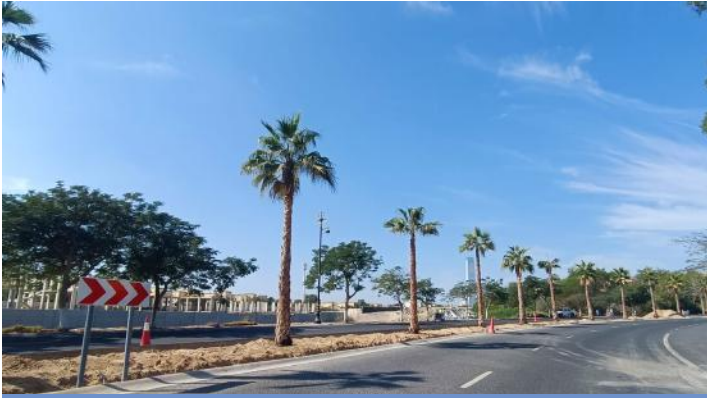
Centre median and right-of-way works in progress along stretch of road running from Cluster 30 to Mansions roundabout.