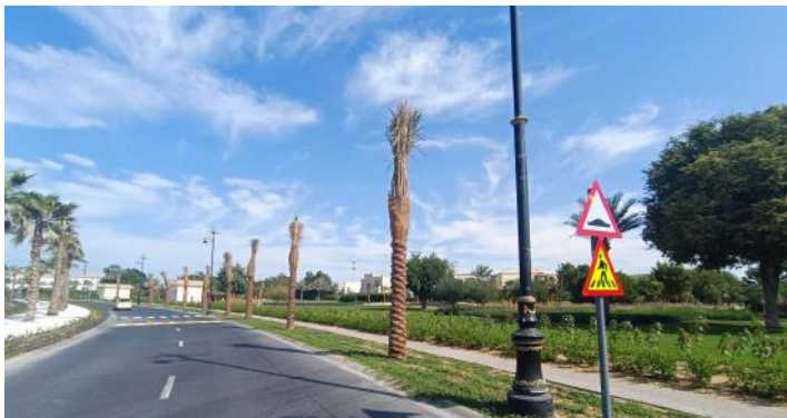
162 palms have been planted along the right-of-way, starting at Gate 3, to replace unviable and removed palms. Another 238 palms are to be planted in the coming weeks.

By the end of December, 80% of earth works and 60% of plantation works related to the centre median and right-of-way landscaping works have been completed. The remainder of the works are to be completed by the end of January 2023.