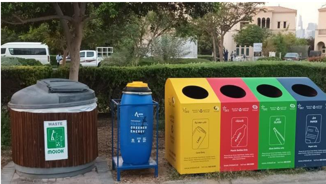
Multiple collection points will be set up across Jumeirah Islands for convenient and safe disposal of used cooking oil.