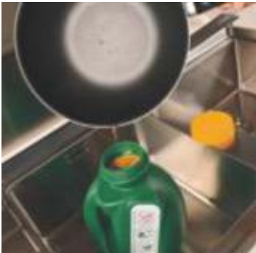
Household-sized collection containers will be distributed to each villa in January 2023

Once the project is set to launch later this month, we will be sharing an informative video on how to safely collect, store and sustainably dispose of your used cooking oil.