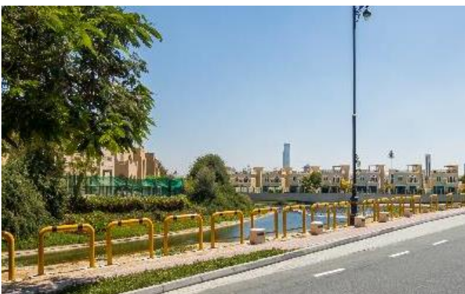
Installed U-shaped bollards at different lake-edge locations for added vehicular safety