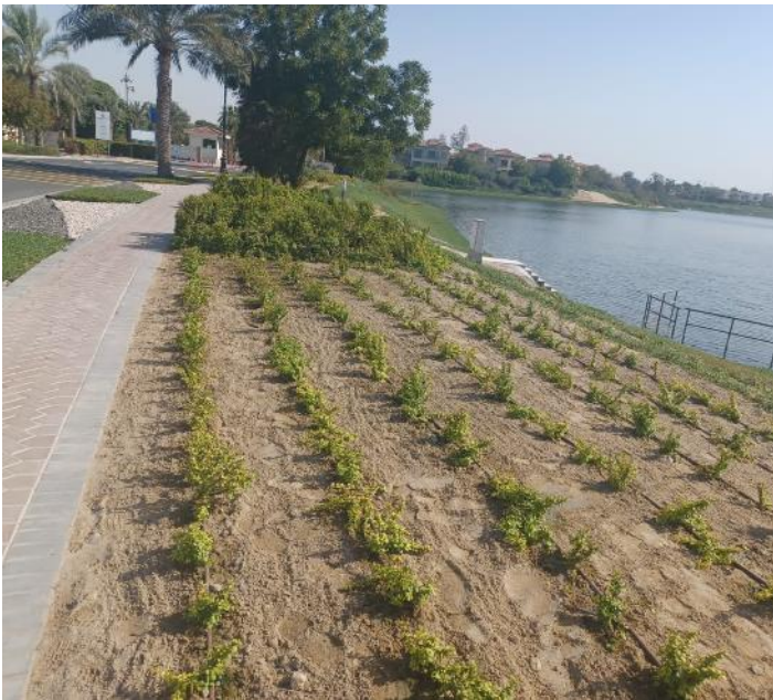
Around Gate number 2