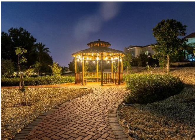
Installed new festoon lights on the gazebo by the fruit garden near Clusters 19 and 20