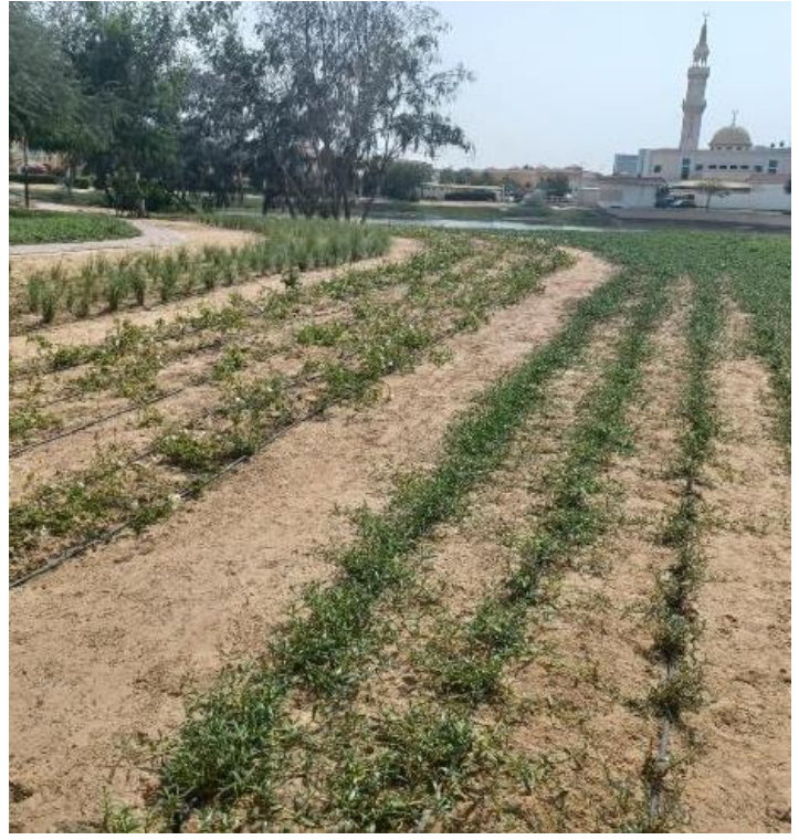
Cluster 50 (work in progress)