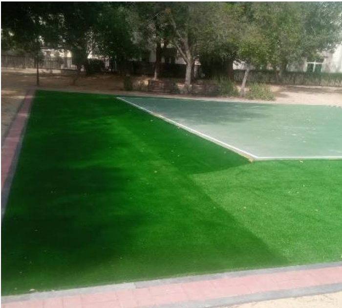
Teqball flooring completed in Rawdha Park