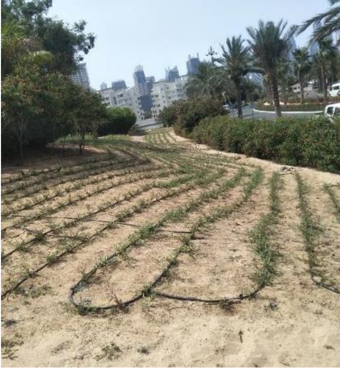
Cluster 6 (work in progress)