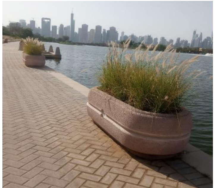
82 planter boxes around lakes were enhanced with plants