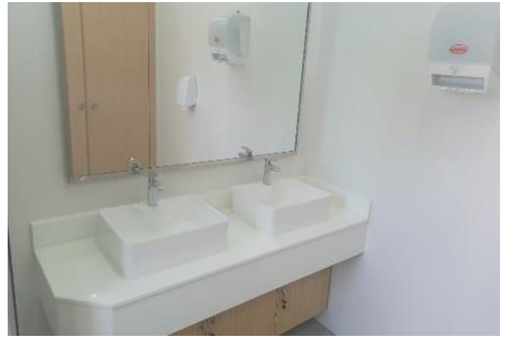
Refurbishment of washrooms at the Cluster 22 park has been completed.