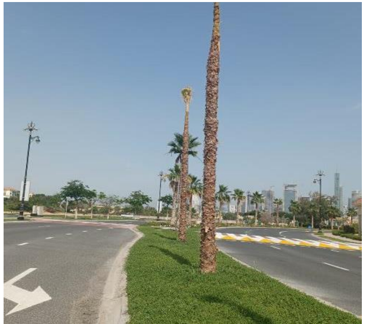
Successful planting of Washingtonias Cluster 5 to Cluster 14