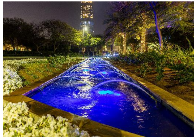
Installed underwater lights in five water features