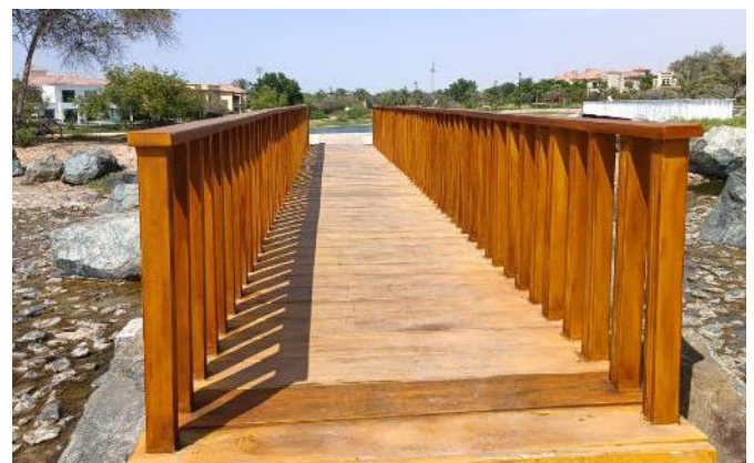
Repainting of six wooden bridges is in progress